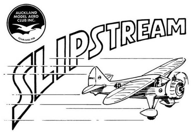
BULLETIN OF THE AUCKLAND MODEL AERO CLUB INC. EST. 1928 August 2013