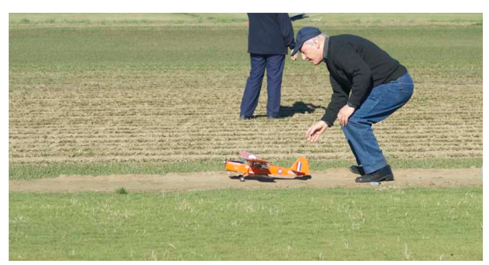
Your editor attempting an ROG at Richmond, that didn't work. See Page 16 to see the place where an ROG did.